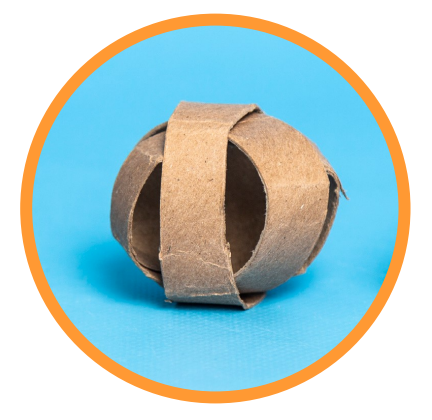
Estimated Completion Time 1 hour - 20 Ring Ball Toys